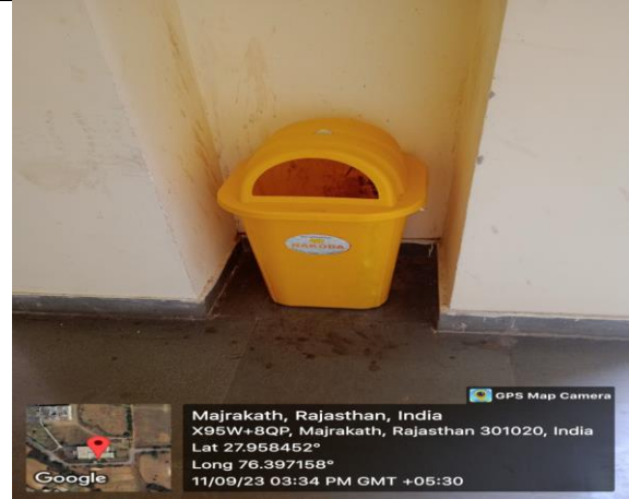
Solid waste management