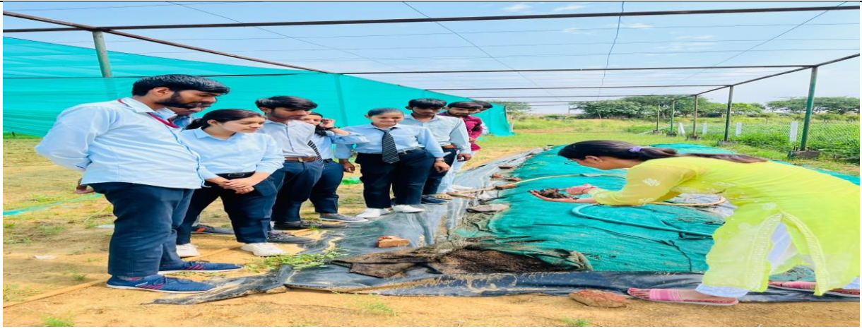
Waste recycling system