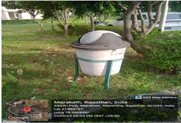
Solid waste management

7.1.3_ Describe the facilities in the Institution for the management of the following types of degradable and non-degradable waste